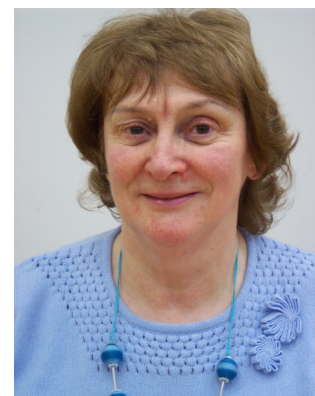
Recipe contributed by volunteer Mairéad Healy

Put all ingredients, except lemon juice, into a bowl. Mix well until it looks like batter. Add lemon zest and stir in. Pour into 2lb loaf tin and bake in oven at 180 degrees for approximately 45 minutes or until a skewer comes out clean. Make syrup by mixing together the sugar and lemon juice and pour over the hot cake.